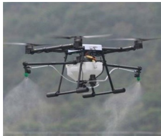
Fig.3. Application of drones for sanitization during COVID-19 pandemic (Singla 2020)

Sanitization was excellent with drones at covid 19 [21-25]. Several studies support this. Scientific papers will make the COVID-19 epidemic more professional. Kumar et al. [15] examined drone-based disinfectant spraying networks. This investigation sprayed a two-kilometer-radius, ten-minute zone without circumstances data. Alsamhi et al. [16] presented a decentralized drone framework. This study also covered drone disinfectant spraying without details. Khan and colleagues [17], Singla [18] say researchers use drones to sterilize and spray disinfectant. In recent studies, a 16-litre drone disinfected 100,000 square meters. According to this knowledge, there is no standard drone disinfection technique, and tank design, size, and nozzle type must be selected to maximize mission success. However, widespread disinfectant use endangers urban animals and people regardless of technology. Dangers may affect both populations. Khan et al. [17] cited material selection-related human difficulties, while Nabi et al. [24] listed several bad urban environment circumstances. These studies indicated that drone sanitization required proper nozzle, tank, and operating mechanism selection.