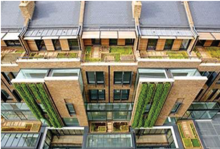
Fig. 2. Green roof and green wall system for the Bentnick street project.

President of Moscow State University of Civil Engineering Valery Telichenko noticed that the BREEAM rating system was applied in Russia for the Olympic buildings at Sochi, and it is now being applied to the sporting objects for the FIFA World Cup 2018, in Russia there are currently around 60 construction projects, which have BREEAM certificates, not only sports facilities [9,10]. For example, green roof and green walls have been BREEAM Excellent to create an enjoyable outdoor space for the residents of premium mixed-use development in central London (see fig.2).