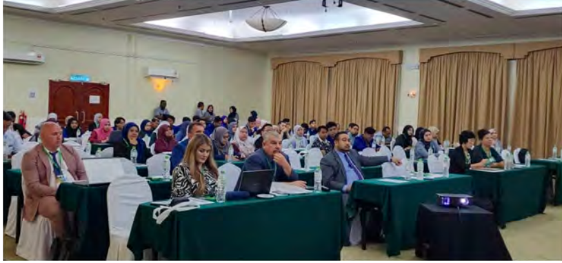
Face-to face Session (23 rd August 2023) Bella Vista Waterfront Resort, Langkawi, Malaysia