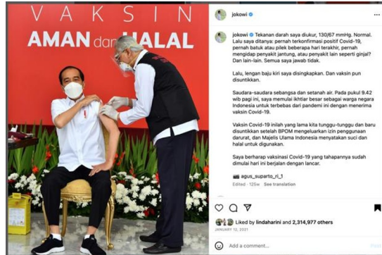
Picture 1. Joko Widodo shown himself vaccinated by doctor Post by 12 January 2021

The data gathered in Joko Widodo Instagram account reveals some issues that focus on Joko Widodo implementing a narrative construction for the COVID-19 vaccine campaign that focused on several key elements including importance of vaccination. As seen in picture 4.1 Jokowi emphasized the importance of vaccination as a crucial step in controlling the spread of the virus and protecting public health. He highlighted that vaccination would play a critical role in saving lives, reducing hospitalizations, and ultimately enabling the country to overcome the pandemic.