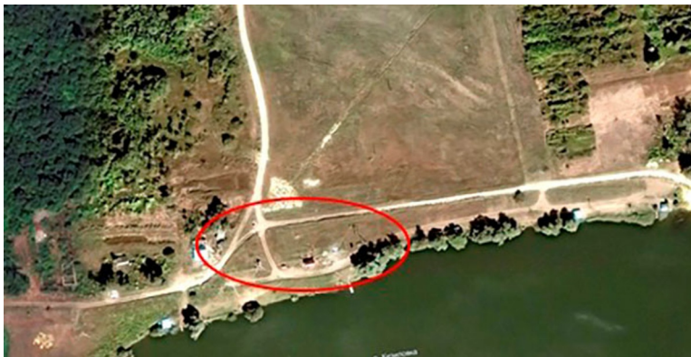
Fig. 5. Study of the situation in the area where the land plot with cadastral number 26:11:021003:35 is located on different dates using the photogrammetric method based on satellite imagery for 2015.

The image taken in April 2012 showed that the territory of site cadastral number 26:11:021003:35 and the adjacent territory also do not contain signs of the presence of buildings, foundations, or traces of construction work. There is also no road in the area, along which at the time of the survey the boundaries of the site 26:11:021003:35 are located.