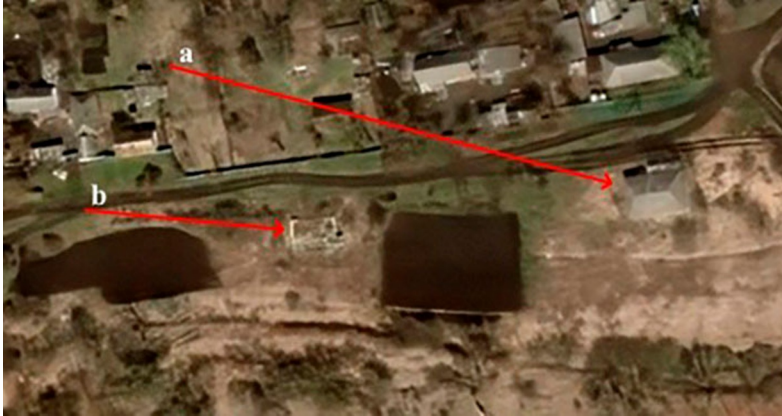
Fig. 8. Location a) building on site 26:11:021003:40 and b) building next door.

Technical Data Sheet of 2008 and existing on the ground at the time of preparation of technical passports (from 2004 to 2009).