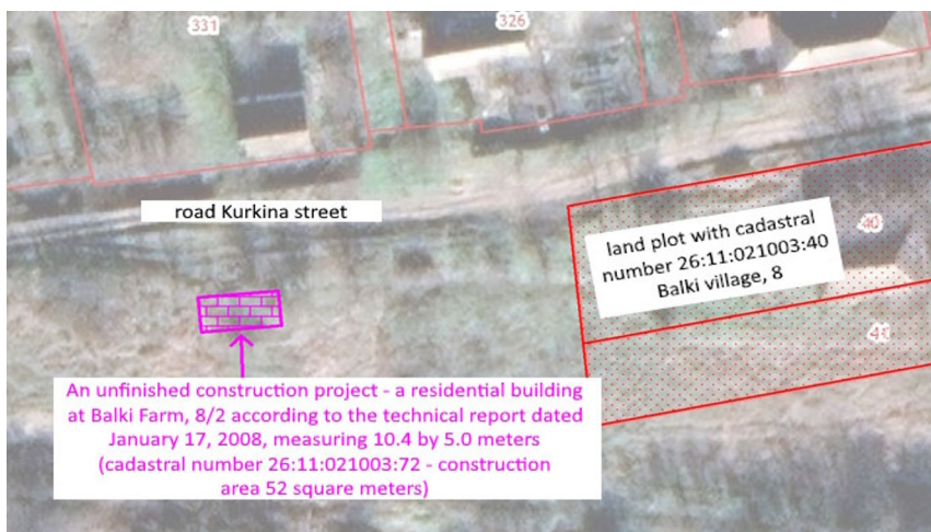
Fig. 9. Location of the structure with cadastral number 26:11:021003:72.

Thus, the location of the structure with cadastral number 26:11:021003:72 is determined according to the Technical Data Sheet dated January 17, 2008 for the Unfinished Construction Project - a residential building at address x. Balki, 8/2, satellite imagery and on-site survey data