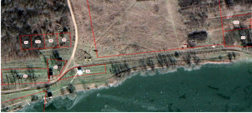
Fig. 6. Study of the situation in the area where the land plot with cadastral number 26:11:021003:35 is located for different dates using the photogrammetric method based on satellite imagery for 2022.

From the images taken in December 2022, it is clear that the boundaries of the cadastral number 26:11:021003:35 section and other sections are aligned with the image. There are no signs of the presence of the object specified in the 2008 technical passport on the site.