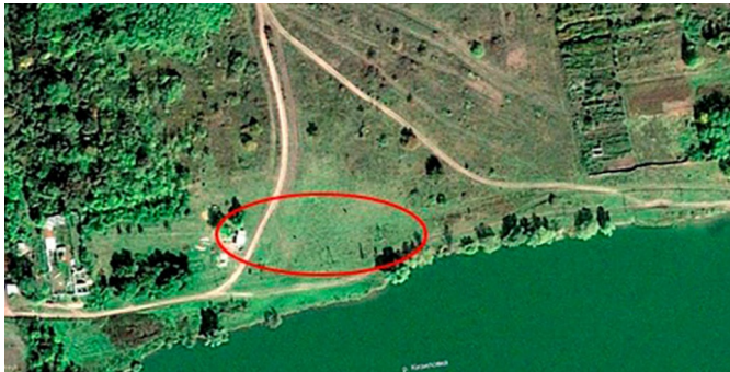
Fig. 3. Study of the situation in the area where the land plot with cadastral number 26:11:021003:35 is located on different dates using the photogrammetric method based on satellite image data for 2009.

The image taken in March 2004 shows characteristic objects for visual reference: a fork in the road, a coastline. The territory of the site cadastral number 26:11:021003:35 and the adjacent territory does not contain signs of the presence of buildings, foundations, or traces of construction work. There is also no road in the area, along which at the time of the survey the boundaries of the site 26:11:021003:35 are located.