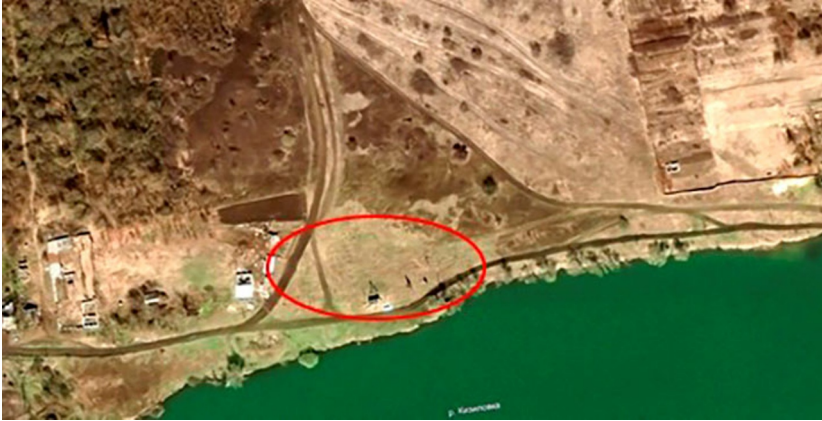
Fig. 4. Study of the situation in the area where the land plot with cadastral number 26:11:021003:35 is located on different dates using the photogrammetric method based on satellite imagery for 2012.

Similar to the previous image, the territory of site cadastral number 26:11:021003:35 and the adjacent territory do not contain signs of the presence of buildings, foundations, or traces of construction work. There is also no road in the area, along which at the time of the survey the boundaries of the site 26:11:021003:35 are located.