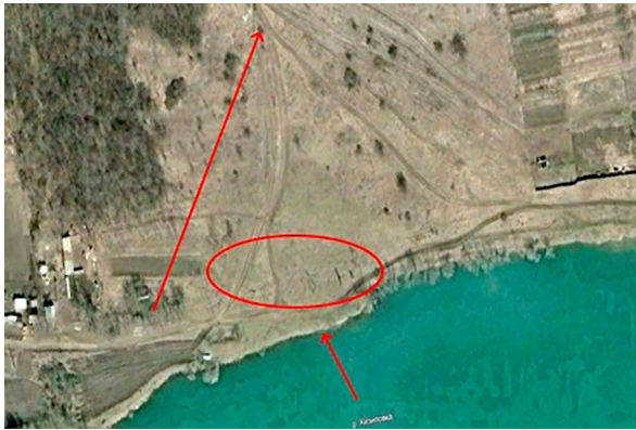
Fig. 2. Study of the situation in the area where the land plot with cadastral number 26:11:021003:35 is located on different dates using the photogrammetric method based on satellite image data for 2004.

That is, the Technical passport dated January 17, 2008 for the unfinished construction project at address x. Balki, 8/2 could not relate to the territory of the land plot with cadastral number 26:11:021003:35 in the coordinates at which the plot is currently registered in the Unified State Register of Real Estate. An object of unfinished construction - a foundation and walls made of sawn rubble measuring 10.4 by 5.0 on the territory of a land plot with cadastral number 26:11:021003:35 in the coordinates at which the site is registered in the Unified State Register of Real Estate, was currently absent and is absent (in the period from 2004 to present time)