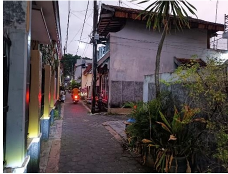
Fig. 2. Utilization of narrow land for butterfly pea plants