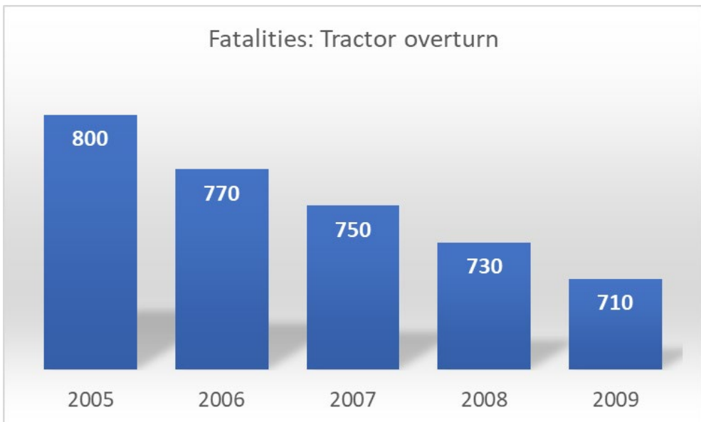
Fig. 1. Fatalities due to tractor overturn in the US annually between 2005-2009.