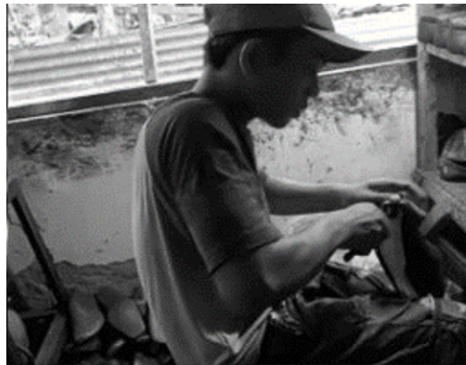
Fig. 1. Shoe production process with manual tools

that has many micro, small and medium enterprises (MSMEs), almost 306,481 [5]. UD. Bajarsari is one of the MSMEs in Sidoarjo that produces shoes. The shoe products produced include school shoes, office shoes, loafers, and safety shoes. UD. Bajarsari in producing shoes still uses simple equipment and is done manually, so the quality and quantity of production are still low [6]. However, UD. Banjari still has to carry out production because it already has many customers who order from the place and the number of shoe users is increasing [7]. The process of making shoes at UD. Bajarsari can be seen in Fig. 1.