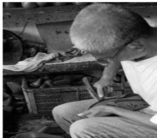
Fig. 2. Shoe gluing process

The production equipment used in general still uses conventional tools, making it difficult to produce goods effectively and efficiently. The condition of the existing equipment is quite poor and it is necessary to update the tools and machines to improve the quality and quantity of production [8]. The process of gluing the sole and upper is done by gluing the upper to the sole, then followed by beating and pressing using a hammer so that the upper and sole can adhere firmly as shown in Fig. 2.